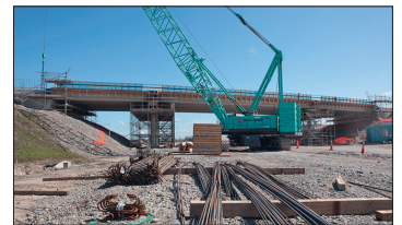
Work continues on the Southern motorway.