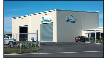
Stevens Seeds, an independent grain and seed company.