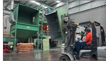
Seed mixing plant at PGG Wrightson.