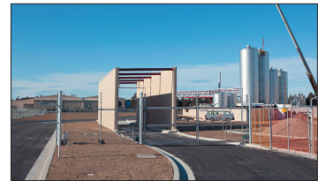
Westland Milk Products expansion.