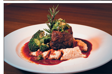
Finalist beef dish.