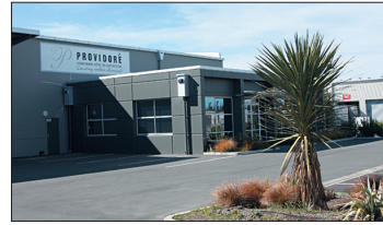
Providore, a high-end corporate gifts company.

He predicts strong buyer levels will continue, fuelled not only by the search for stable land and the earthquake rebuild but completion of the Christchurch Southern Motorway and various regional irrigation schemes which will ultimately deliver more than a billion dollar boost to the national economy.